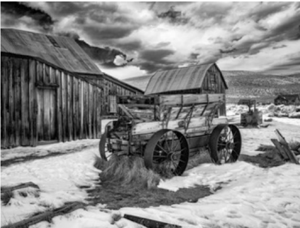
TWO – Title: One Wagon Bodie – This image is from Bodie, CA. a ghost mining town in the eastern Sierra Nevada Mountains.