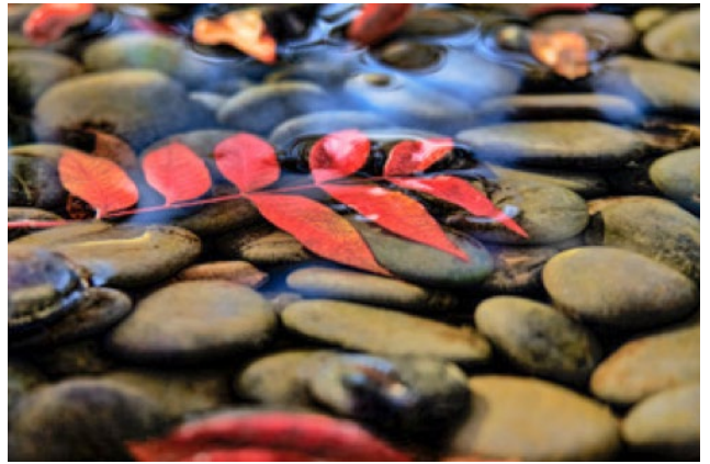
FOUR – Title: Leaves in Water – This image is fall leaves floating in a cool stream filled with smooth rocks in a part of the Merced River.