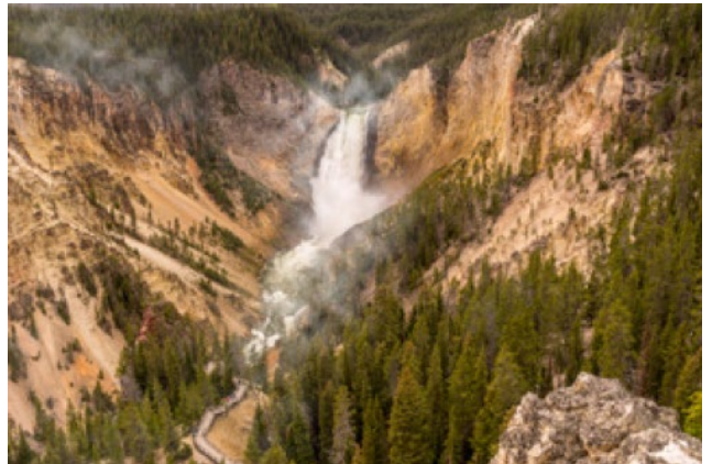
SIX – Title: Lower Yellowstone Falls – This image takes in the grand view of the Yellowstone Falls from Artist Point in the Grand Canyon of the Yellowstone National Park.