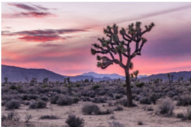
THREE – Title: Joshua Tree Sunset – This image is from Joshua Tree National Park in the Southern California desert.