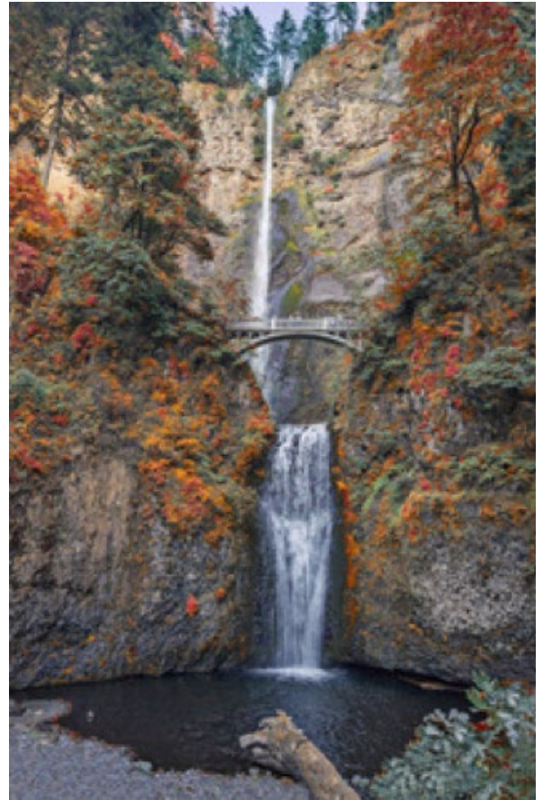
FIVE – Title: Multnomah Falls This image is of a famous waterfall in the Columbia River Gorge, Oregon.