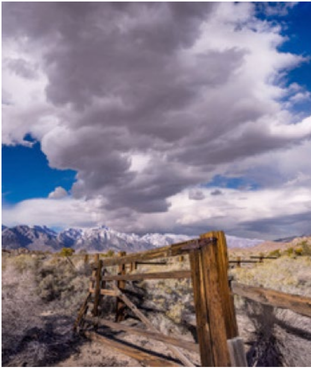
ONE – Title: Mountains and Sky This image is from the Alabama Hills in the Eastern Sierra Nevada Mountains. Mt. Whitney is in the distance.